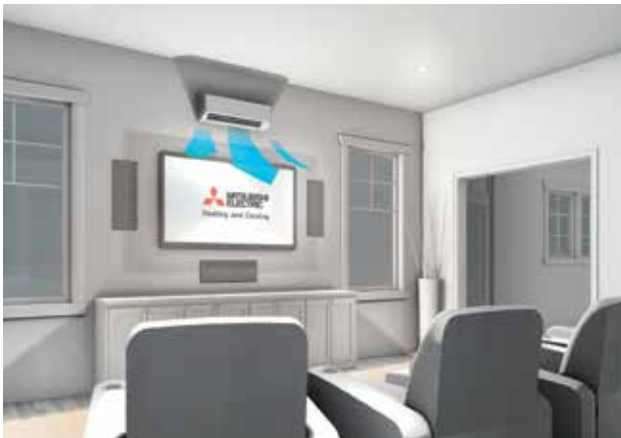
Bonus Rooms / Guest Rooms